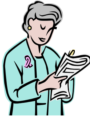
Plan to Donate September 23rd